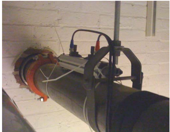
FLD22 Ultrasonic Sensor on Pipe