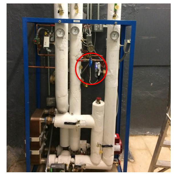
Badger 380 BTU meter on DHW skid across useful HX1 (THW1, THW2, FHW) located in the boiler room.