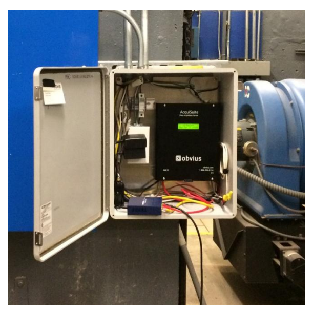
CDH panel containing data logger and CDH network switch located in the boiler room.