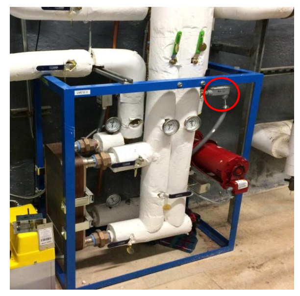
Veris 10K Type II Thermistor (THW3) on Dump Radiator skid after HX2 located in boiler room.