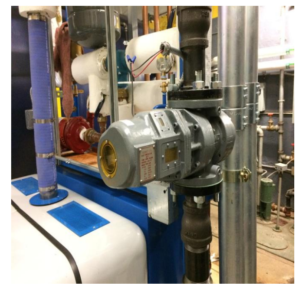
Romet RM2000 gas meter (FG) located on cogen unit skid.