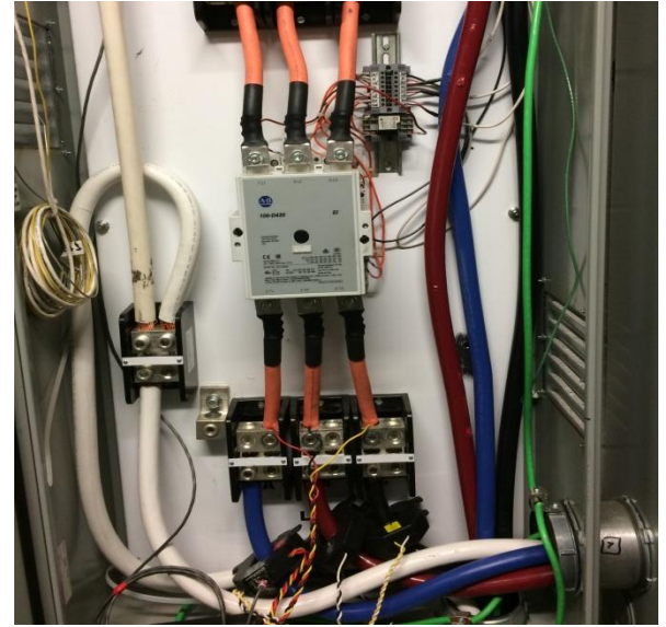
Gross generator power meter (WT) located in the inverver contractor panel in the electric room above the boiler room.