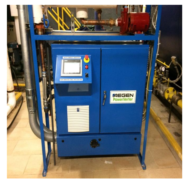
Aegen PowerVerter 100 kW cogen unit located in the boiler room.