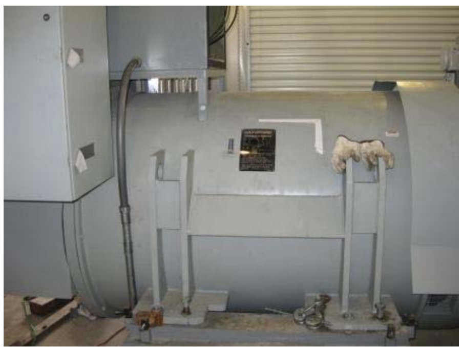
Fig 4: New 1 MW Generator