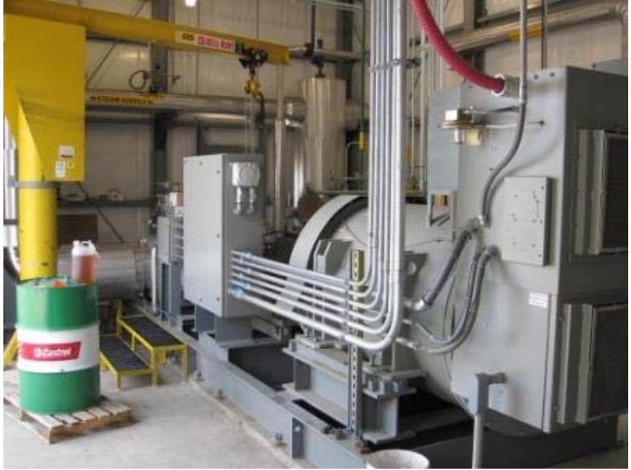
Fig 11: STG Finalization