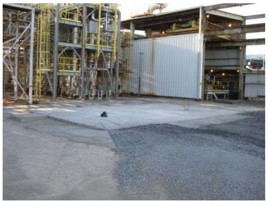
Fig 7: STG Foundation