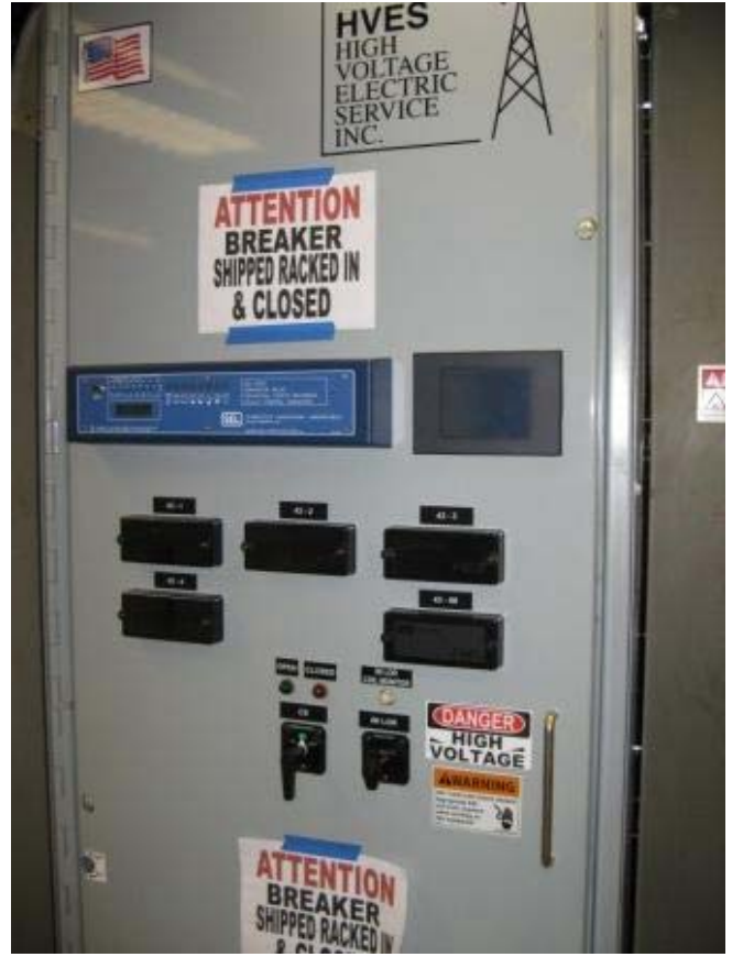
Fig 5: New Circuit Breaker