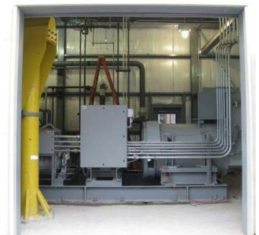
Fig 10: STG Installation