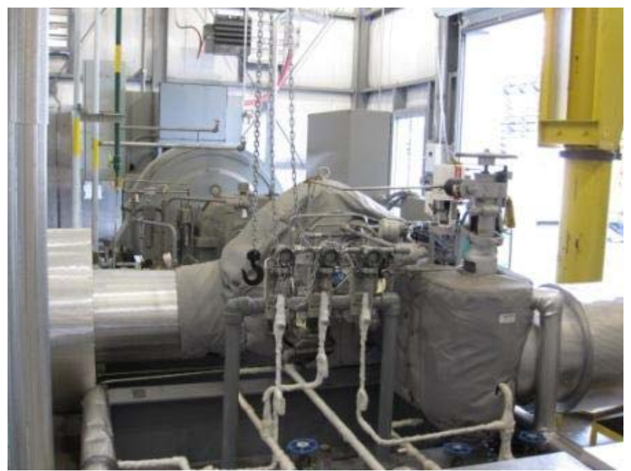
Fig 12: New Steam Turbine Generator