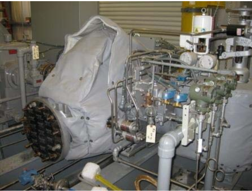
Fig 3: New Steam Turbine

The installed steam turbine generator utilizes a pre-existing steam flow to generate electricity for site use. The steam flow is used to heat a heat exchanger in one of the chemical units. Instead of using a control valve to maintain flow, the STG is used to modulate steam flow to the desired set point while producing up to 1MW of electricity.