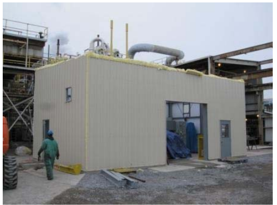
Fig 8: STG Building