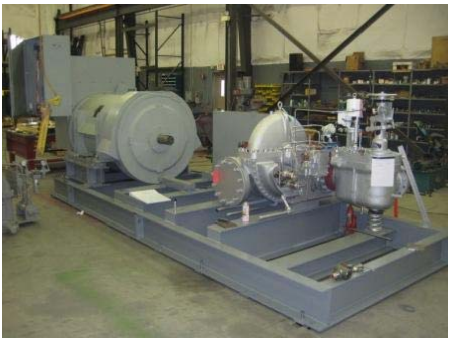
Fig 9: STG Fabrication