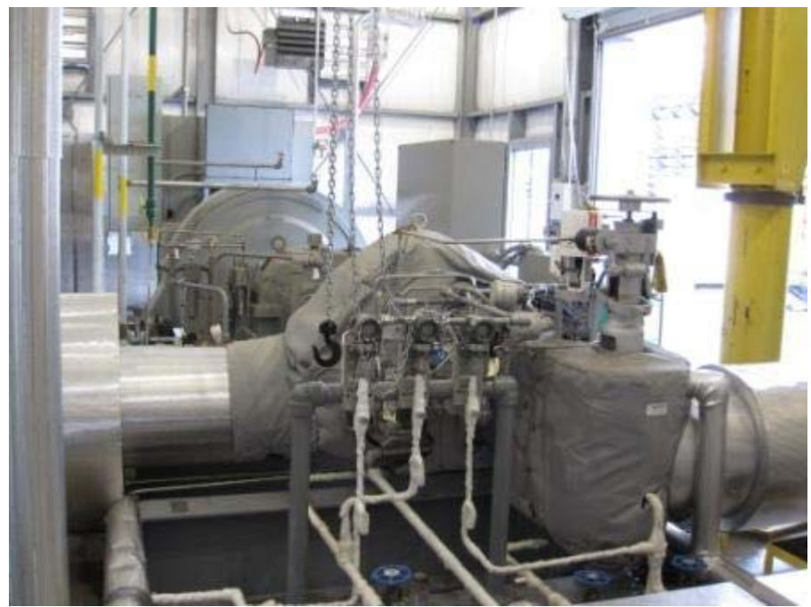
Fig 1: New Steam Turbine Generator

The installed Steam Turbine Generator system consists of one (1) 1 MW unit with a total peak power production of 1 MW. The unit was provided on a pre-wired, prepiped, skid. The skid is located in a new STG building.