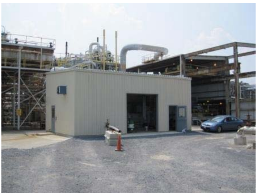
Fig 2: New Steam Turbine Generator Building

The Steam Turbine Generator building was fabricated on site to house the unit. The inlet and outlet steam piping was also fabricated and installed on site by contract construction firms. Instrumentation for pressure, temperature, and steam flow was also installed.